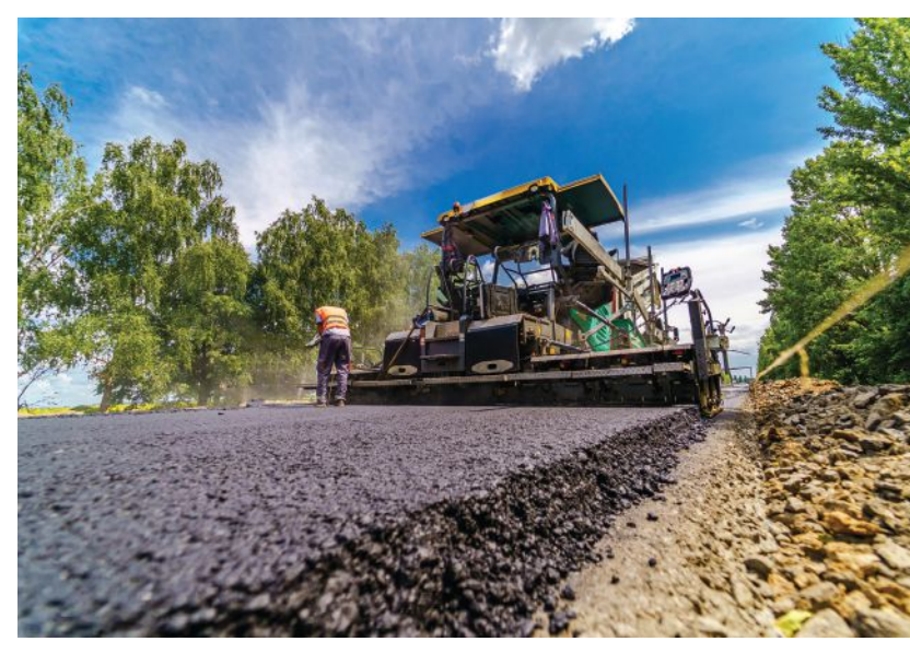
An asphalt paving site.

Long-term pavement performance is the result of the smoothness and mat quality of the HMA mixture. Smoothness affects the