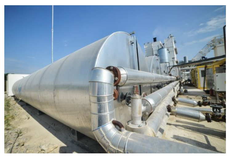
Pipelines transporting mixed asphalt.