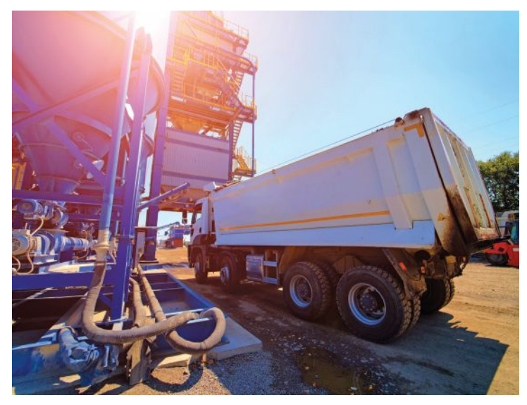
The point of transfer from the mixing plant with material transfer vehicles.