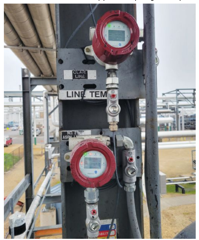
Figure 4: SME-TRD transmitter displaying real-time viscosity readings from SRV deployed at an asphalt terminal

Figure 3: Showing the sensor electronics (SME-TRD transmitter) connected to the SRV installed in a pipeline transporting mixed asphalt